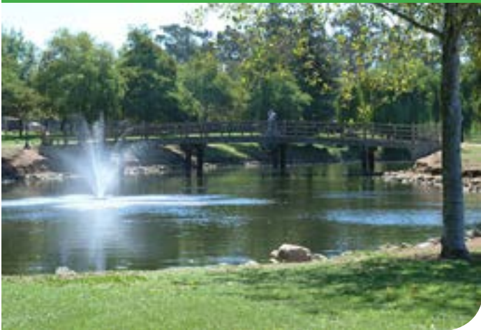
Recycled water is used in water features and the irrigation system of the Evergreen Community College campus in south San José.