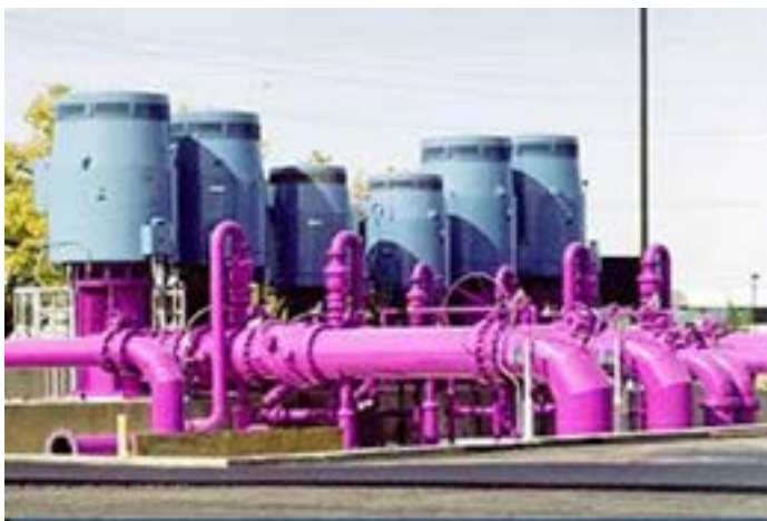
SBWR main pump station