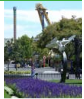
Great America irrigates with recycled water