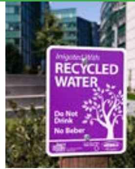
recycled water signage